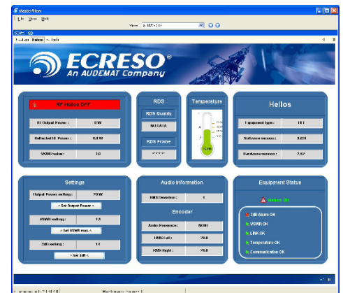
Ecreso 500 W Helios exciter view

* Most EasyLink applications are available with an RS-232 connection. Depending on supported equipment some are available with an RS-485/ModBus or IP connection.