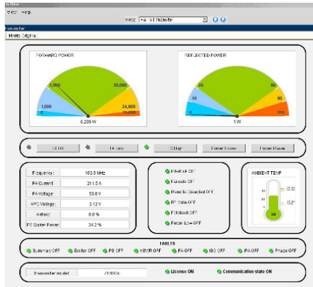
Harris Z view

Note that all MasterView views can be customized to your specifications, and all readings and controls can be integrated in the views with other data from a different EasyLink or traditional I/O connections.