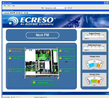
NEXT FM view